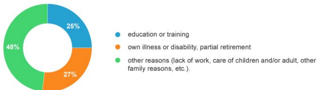
Reasons why employees worked for part-time (in %), Slovenia, 3 th quarter 2019

Of the total number of employees (849,000), 92% were working full-time and 8% part-time. Compared to 2018 the share of full-time employees increased by 2% and the share of part-time employees decreased by 7.7%. Approximately 66,000 employees worked part-time. Among reasons why they worked part-time they stated in 26.9% of cases own illness or disability, partial retirement, in 25.1% of cases education or training, and in 48.1% of cases other reasons (lack of work, care of children and/or adult, other family reasons, etc.).